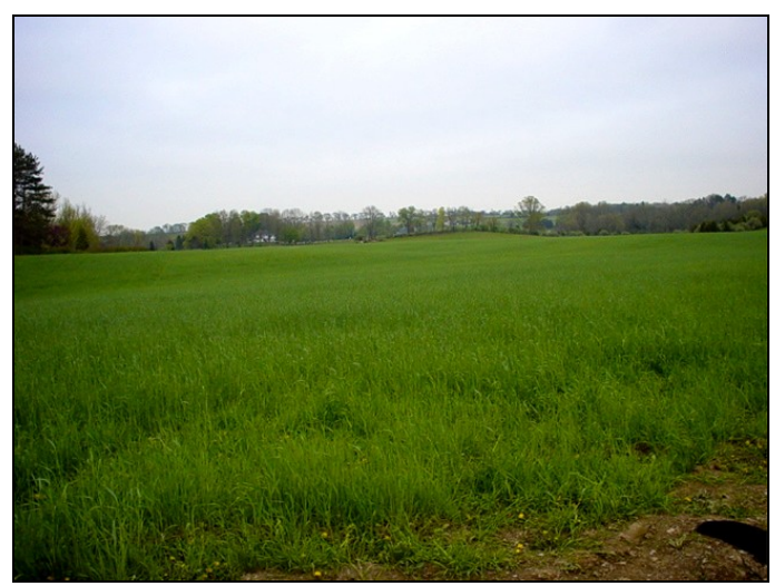
First property preserved with Sussex County Open Space Trust funds Green Township, 2003

"One revived rural community could be the beginning of the renewal of our country. But to be authentic, this would have to be a revival accomplished mainly by the community itself. Done by the ancient rule of neighborliness, by the love of precious things, and by the wish to be at home." Wendell Berry