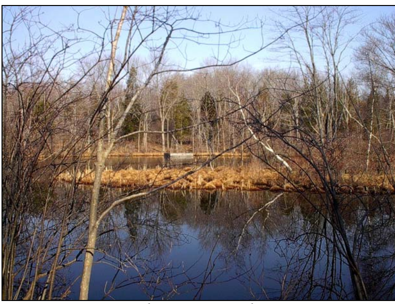
Lake in Byram Township

"By choice, or by default, we will carve out a land legacy for our heirs. We can misuse the land and diminish the usefulness of resources, or we can create a world in which physical affluence and affluence of spirit go hand in hand." Stewart Lee Udall, The Quiet Crisis